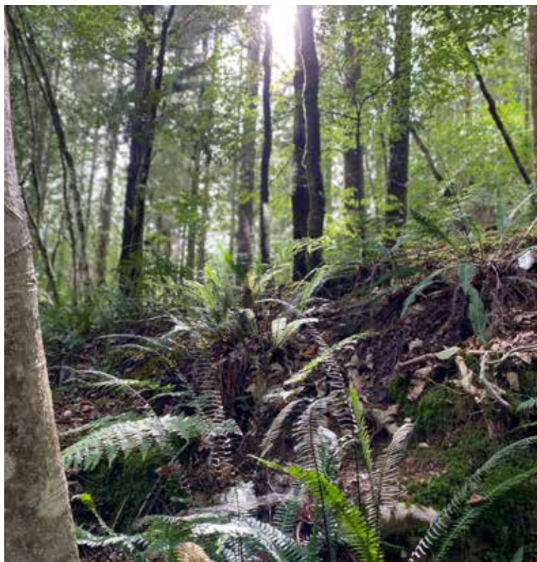
Cardinham Woods doing its Jurassic Park impression