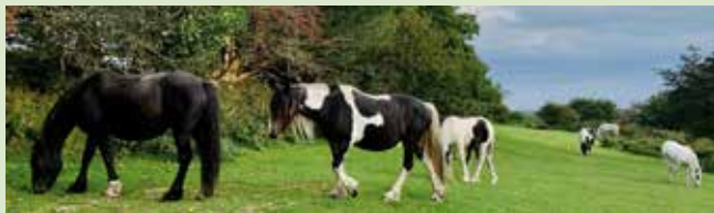
Ponies and foals at Treslea