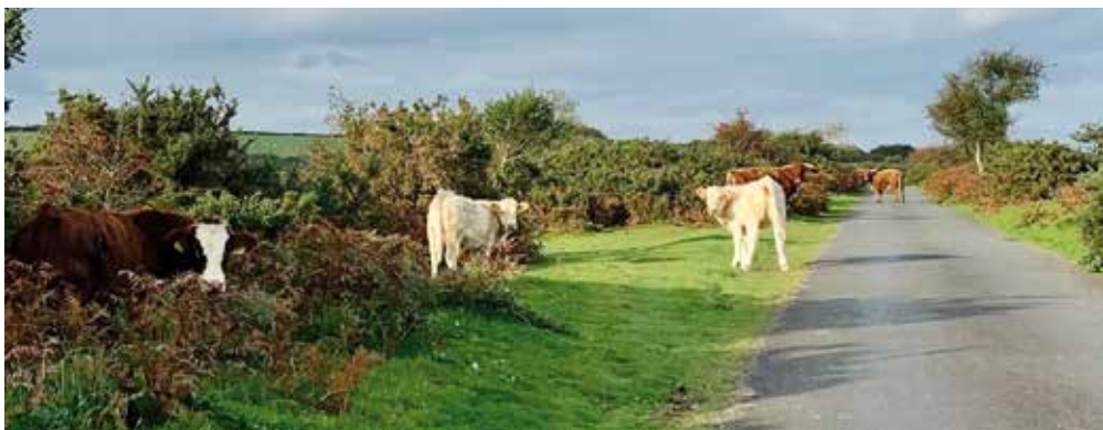
Mooooove along now

Can't make the above days? Feel free to call to book a 1:1 tour!