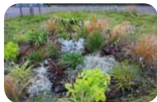
Before and after...The Lost Gardens of Morrisons

Don't forget there are some NGS gardens open this summer, you need to book but they would love your support and you will get a chance to see some garden gems.