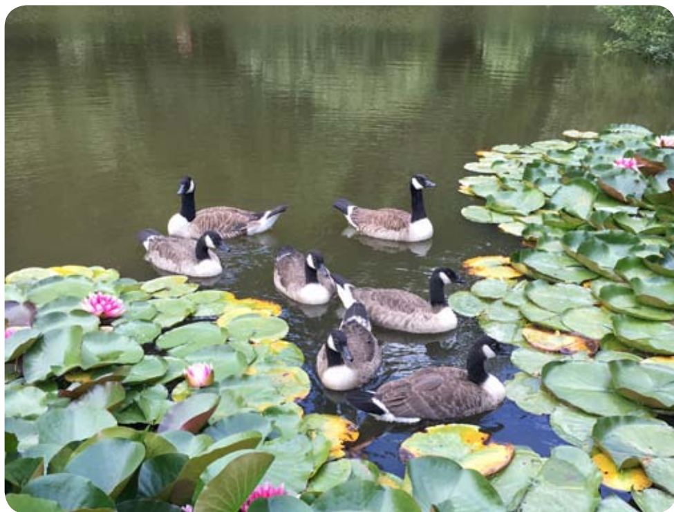
Canadian Geese of Cardinham