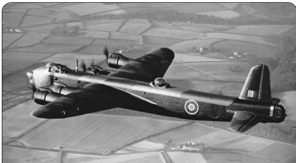
SHORT STIRLING MARK III (RAF*)

My turret at the time we were hit was at 165° to the fore and aft of 'U' ( Ed: I think this is the pet name my Father used for their plane ), I was very highly strung & excited at the time, and when the kite was nearly thrown on her back & an orange sheet of flame flashed by in all that darkness - I fired my guns - the rear gunner took my trace to be coming from an E/A ( enemy aircraft ) - he fired in the direction of my sending trace - but that short burst put me on my feet again and I was quite cool and collected.